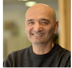
Mehmet Açar Writer, Film Critic